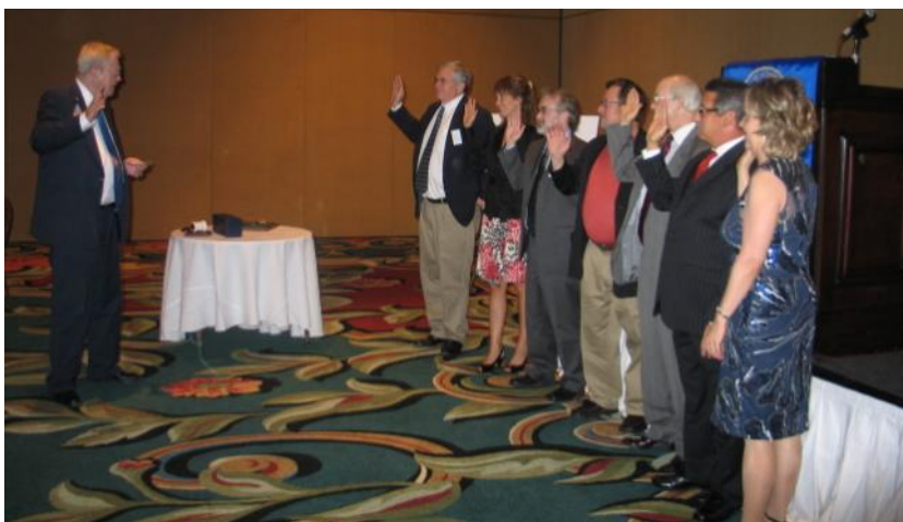
The new NAALJ board is sworn into office