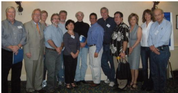
NAALJ Board of Directors