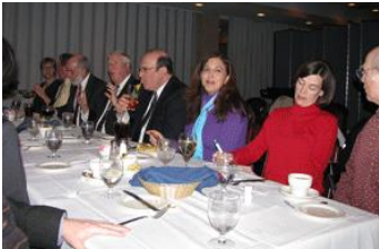
MAALJ members dining