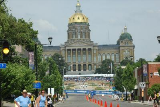
Conference guests had front row seats for the World-Cup Triathlon at the Conference Hotel