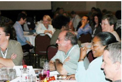
Eliminating bias can be fun!