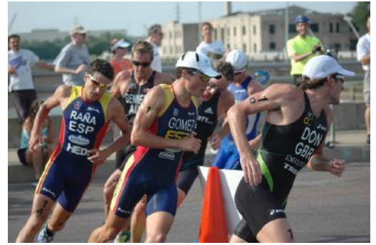
Triathletes round the turn for the final leg to finish at the Capitol Grounds