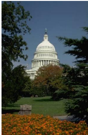
Visit the United States Capitol Building in a Special NAALJ Tour

http://www.wcl.american.edu/events/naalj