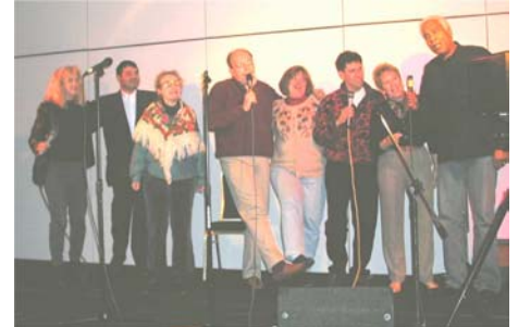
THE NEW YORK GANG – NOT SO FORMAL