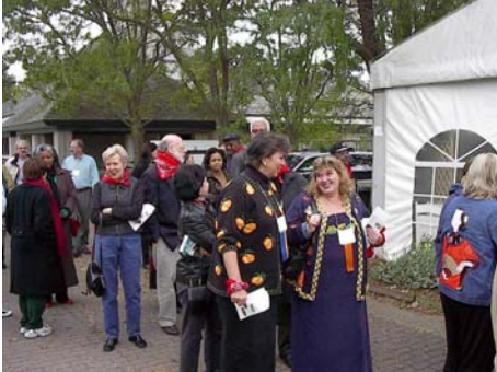
WALKING TO DINNER AT THE HORSE PARK