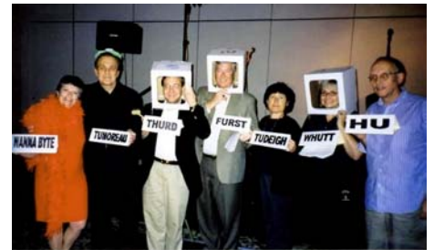
THE MARYLAND CREW - WINNERS ??