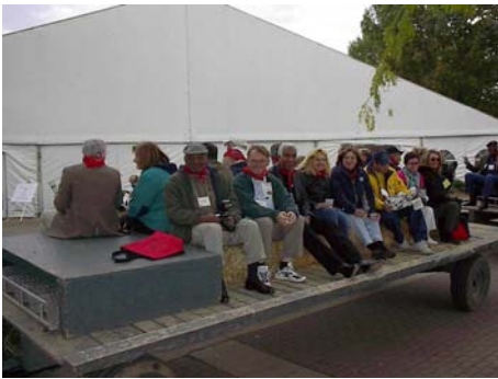
THE HAYRIDE AT THE HORSE PARK