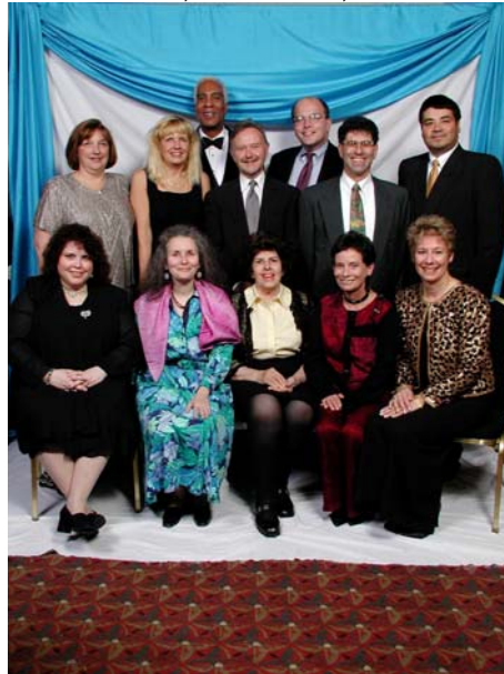
THE NEW YORK GANG – FORMAL