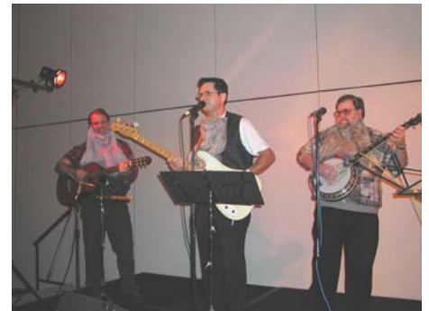
THEY'LL NEVER RECOGNIZE US BEHIND THESE FAKE BEARDS!!!