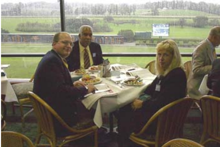
SATURDAY AFTERNOON AT THE RACES