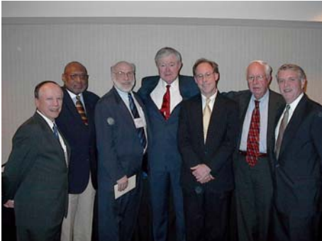
NAALJ PAST PRESIDENTS GET TOGETHER